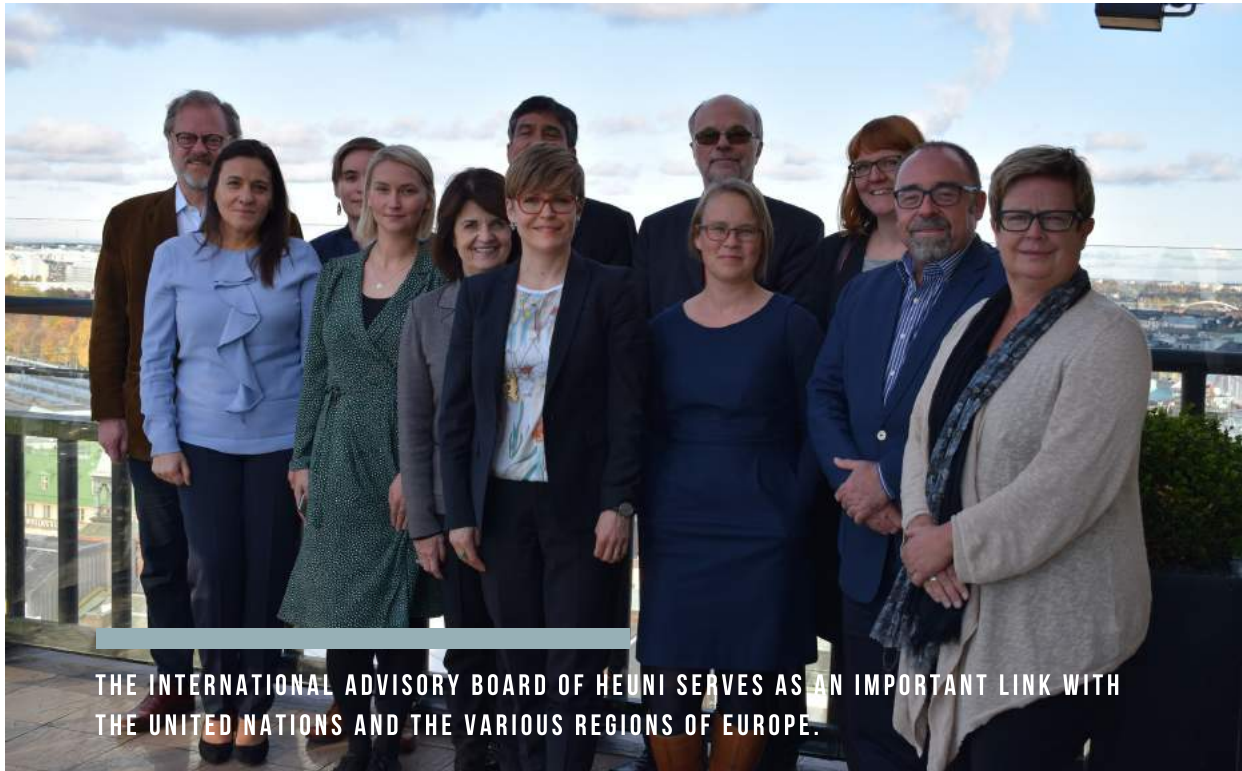
THE INTERNATIONAL ADVISORY BOARD OF HEUNI SERVES AS AN IMPORTANT LINK WITH THE UNITED NATIONS AND THE VARIOUS REGIONS OF EUROPE.

The Chairman of the Advisory Board and four of its members are appointed by the Secretary-General of the United Nations after consultation with the Government of Finland. Four members of the Board, including the Director of HEUNI, are appointed by the Government of Finland. A representative of the United Nations Office on Drugs and Crime participates ex officio in all deliberations of the Advisory Board.